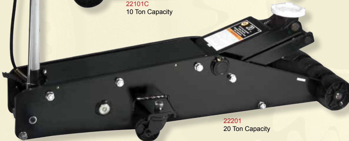
22201 20 Ton Capacity

FAST & SAFE! Convenient foot pedal designed for fast , no load lifts.