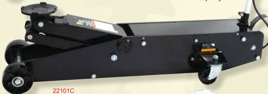
22101C 10 Ton Capacity